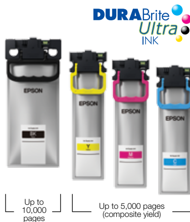
Enjoy greater cost-savings with these high-volume ink packs

In addition, Epson's DURABrite™ Ultra ink delivers laser-like quality prints that are water- and smudge-resistant.