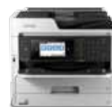
WorkForce Pro WF-C5790 Print/Scan/Copy/Fax

With option of large colour ink packs or XL black ink pack.