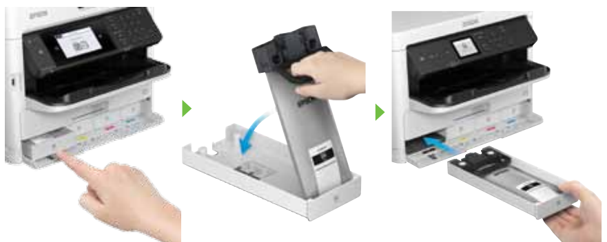
Designed for easy replacement of ink packs